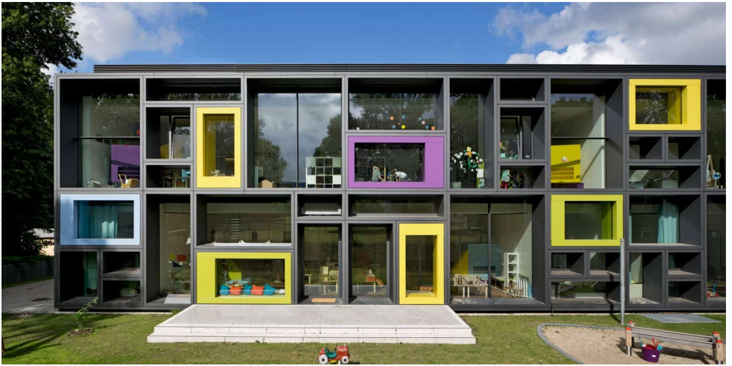
Beiersdorf Children's Day Care Centre 'Troplo Kids'

Typology education Location Hamburg Construction Volume GFA 1,750 m 2 , GV 7,000 m 3 Client Beiersdorf AG Realisation 2012-2014 Certificate DGNB Platin Award BDA Preis Hamburg – honorable mention