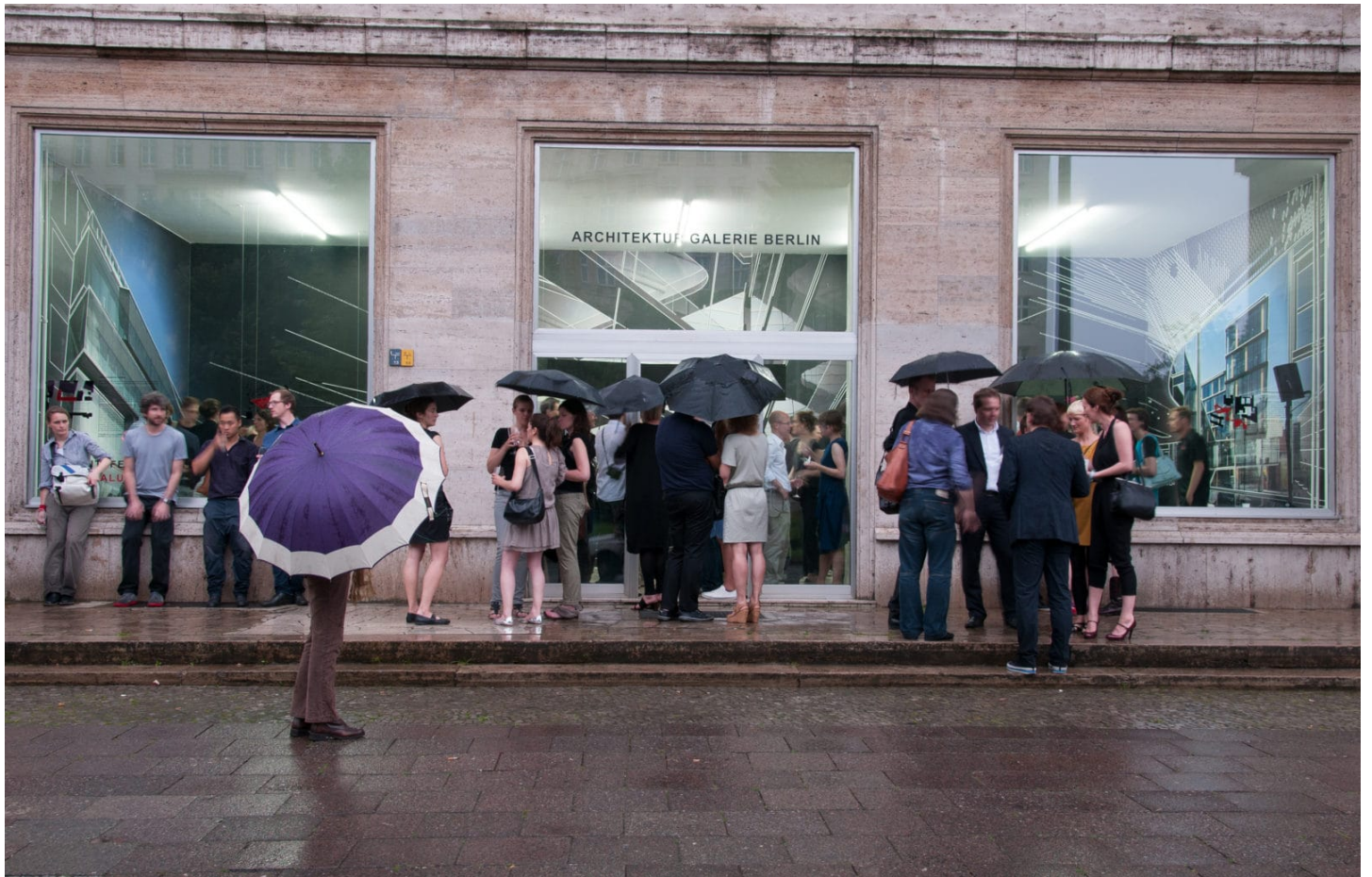
Added Value Space | Exhibition